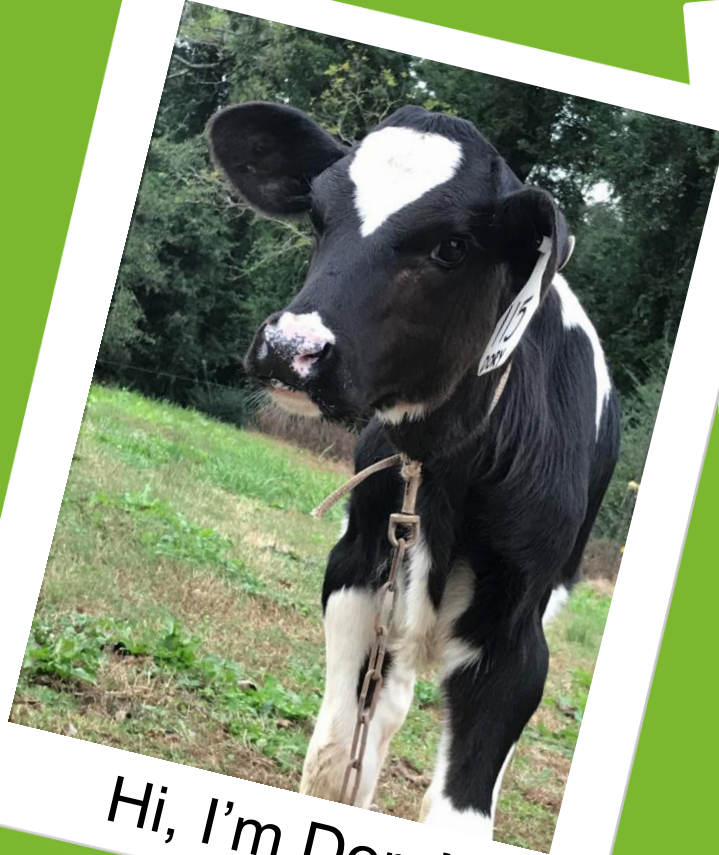
Hi, I'm Dory!