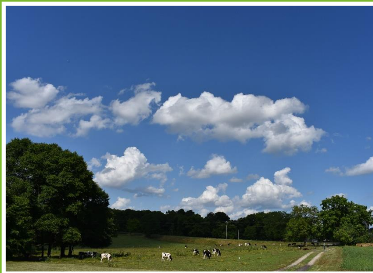
The barn is connected to the wide-open fields of Big Sandy Creek Dairy where 501 can graze all day and enjoy the sun.