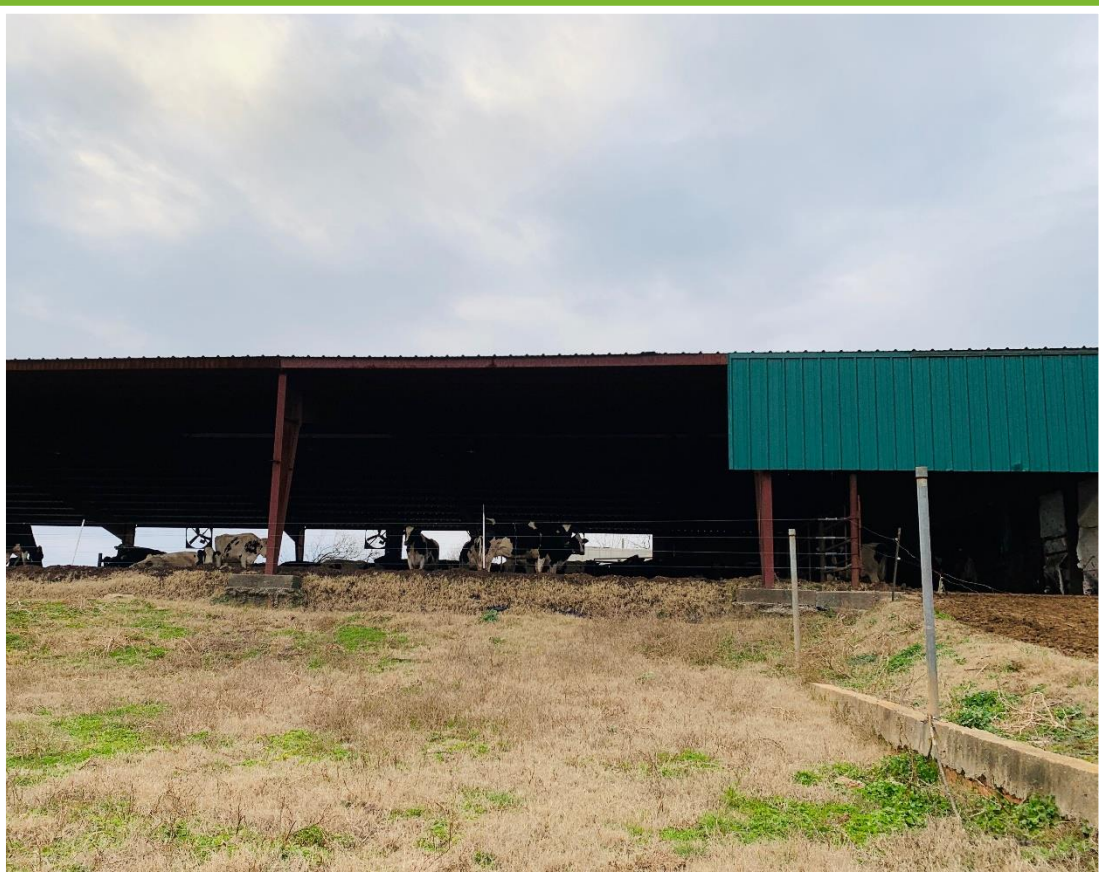
This is the Pack Barn where 501 and her herdmates can go for shelter and shade.